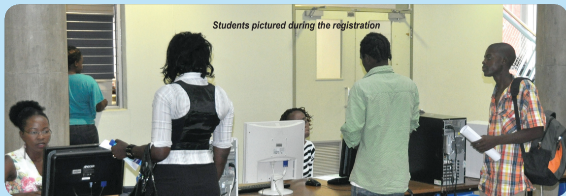
Students pictured during the registration